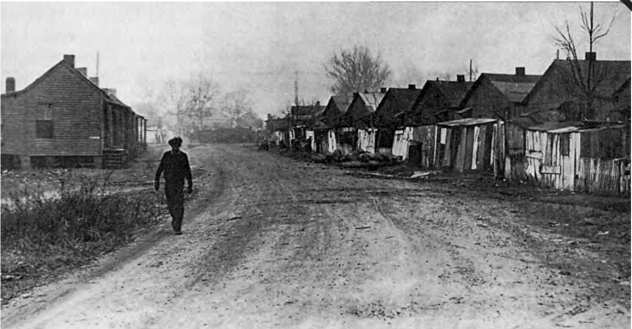
A poverty-stricken farming community in West Virginia towards the end of the 1920s.

13 Study the photograph, and then answer the questions which follow.