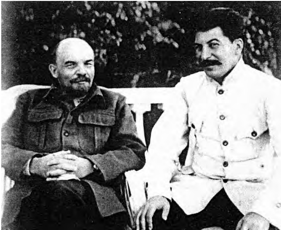
A photograph showing Lenin and Stalin in 1922. It is thought to be a fake.