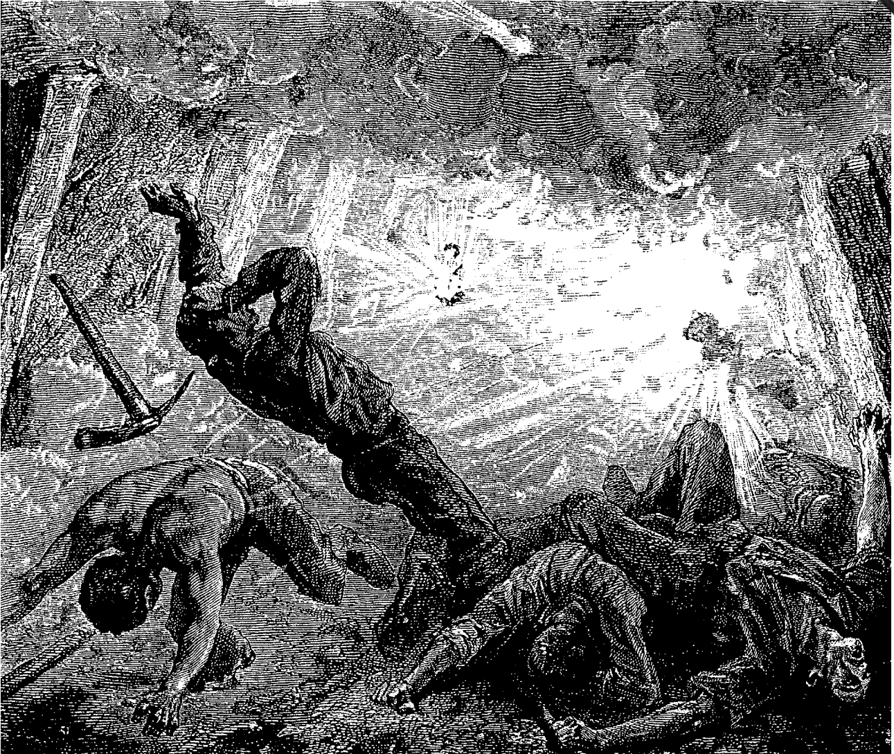
An artist's impression of an explosion in a coalmine.

22 Study the illustration, and then answer the questions which follow.