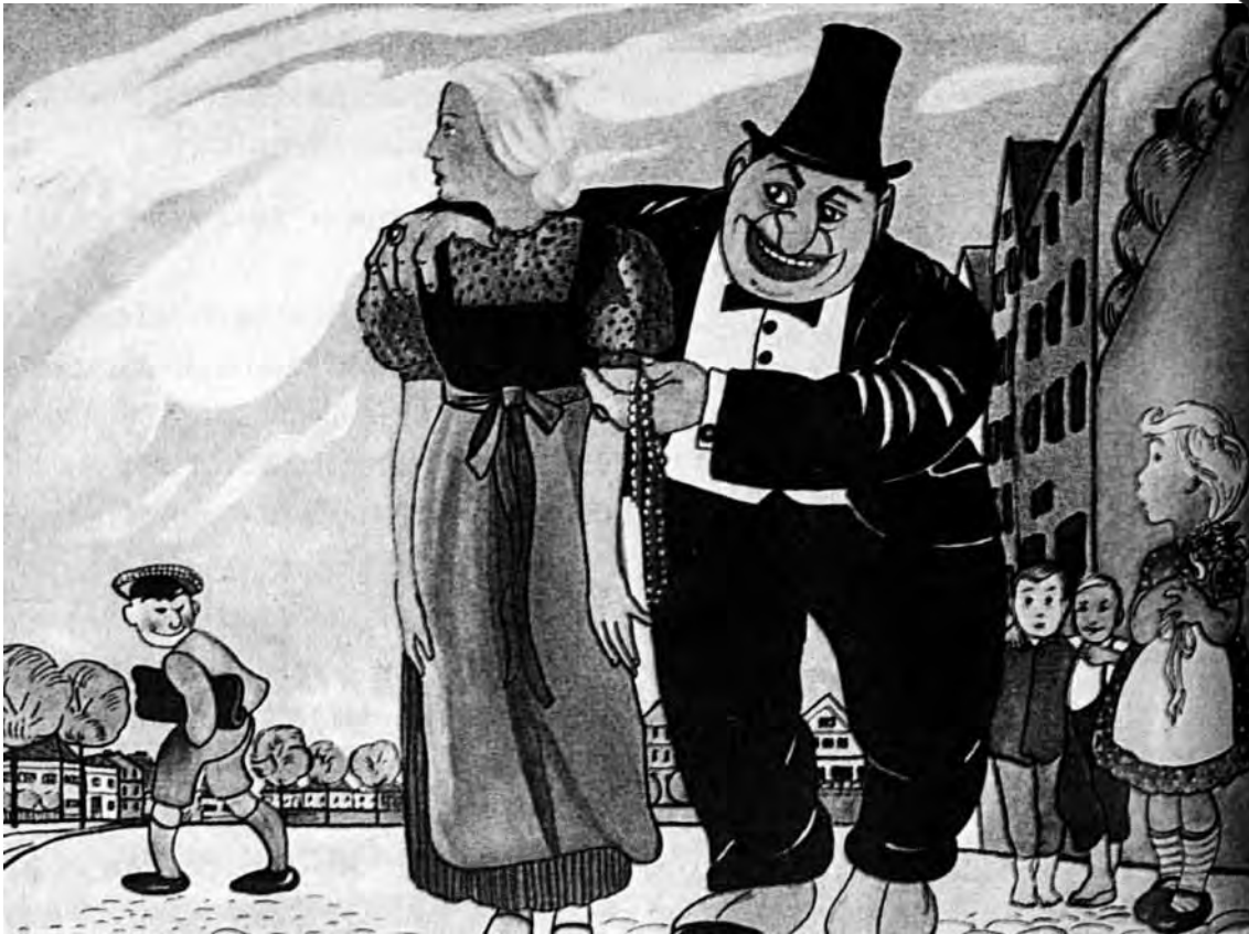
An illustration from a Nazi book to be used in schools.

10 Study the illustration, and then answer the questions which follow.