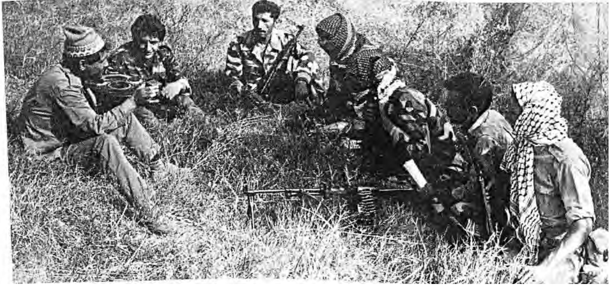
Fedayeen members before an operation against enemy units.

20 Study the photograph, and then answer the questions which follow.