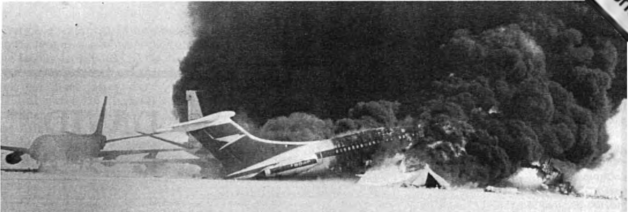
Dawson's Field, Jordan in September 1970.

21 Study the photograph, and then answer the questions which follow.