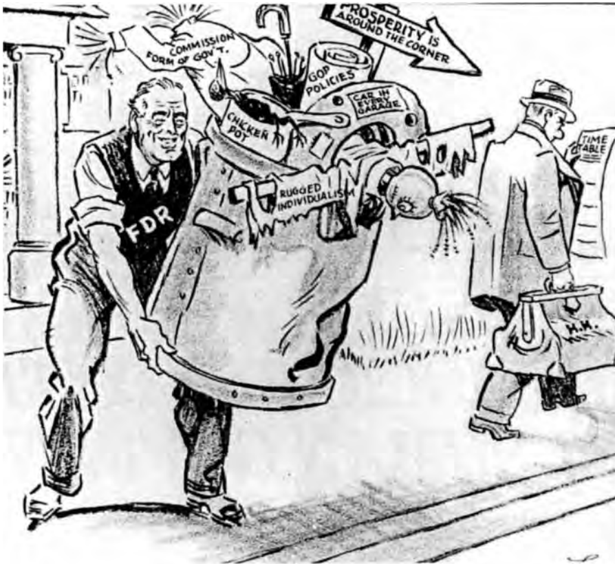
A cartoon about Roosevelt's New Deal.

14 Study the cartoon, and then answer the questions which follow.